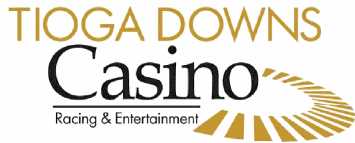
Exhibit X.B.6. – Labor Harmony

Submit as Exhibit X.B.6. a statement as to whether the Applicant or, as applicable, the Manager has entered into labor peace agreements with labor organizations that are actually engaged in representing gaming or hospitality industry workers in the State. Provide copies of any such agreements. If the Applicant or, as applicable, the Manager has not entered into such agreements, provide an instrument stating that it will enter into such labor peace agreements and maintain such labor peace agreements in place during the term of a License.