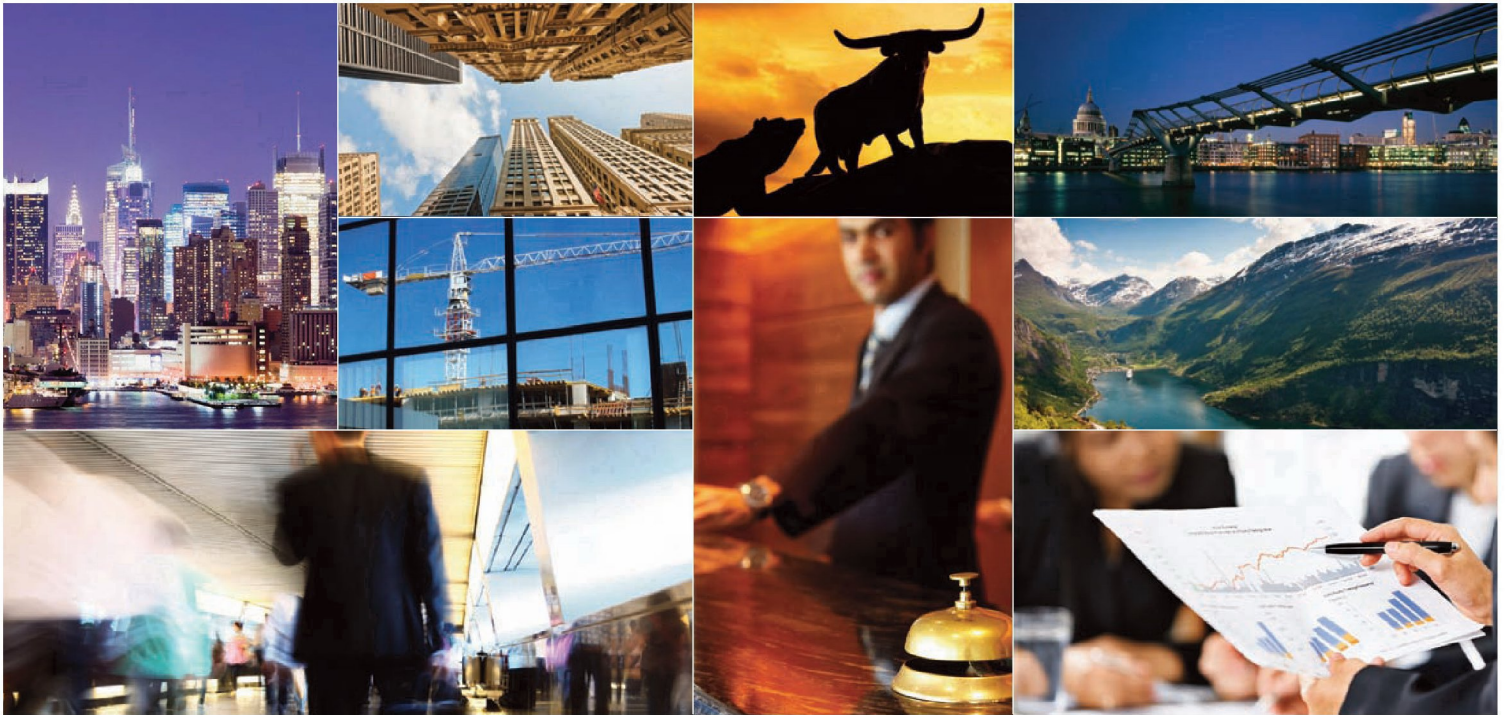
Exhibit VIII.C.18.a. (cont.)