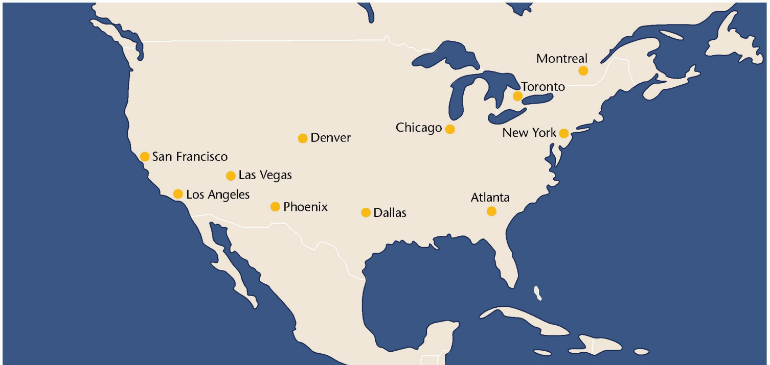
Exhibit VIII.C.18.a. (cont.)