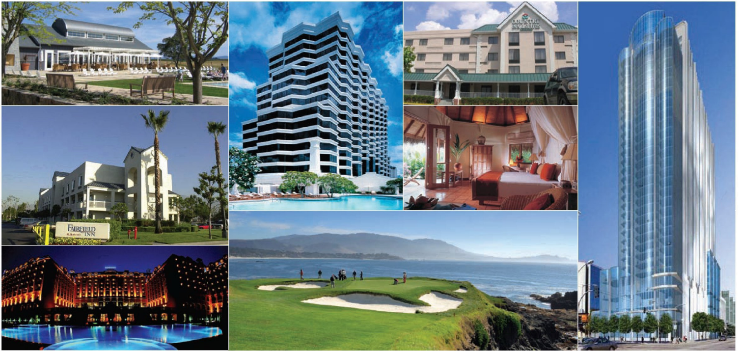
Exhibit VIII.C.18.a. (cont.)