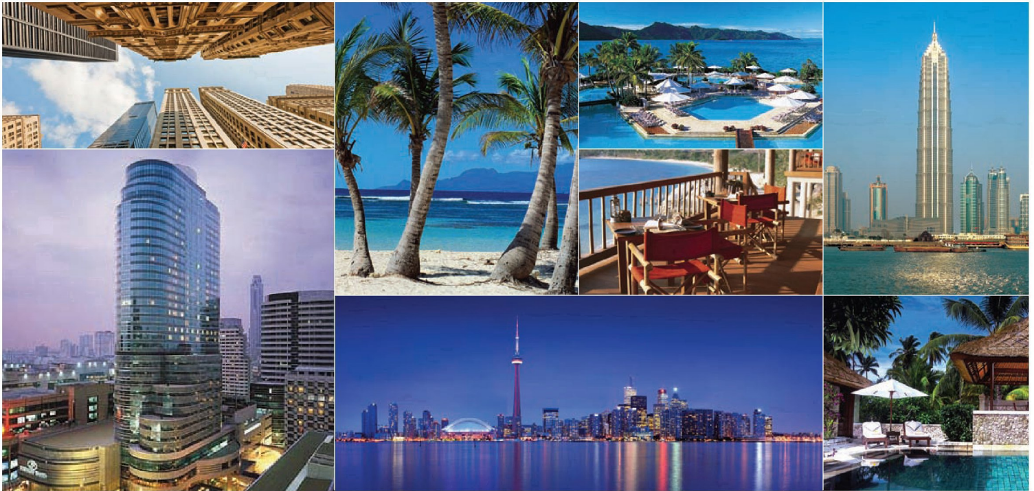
Exhibit VIII.C.18.a. (cont.)