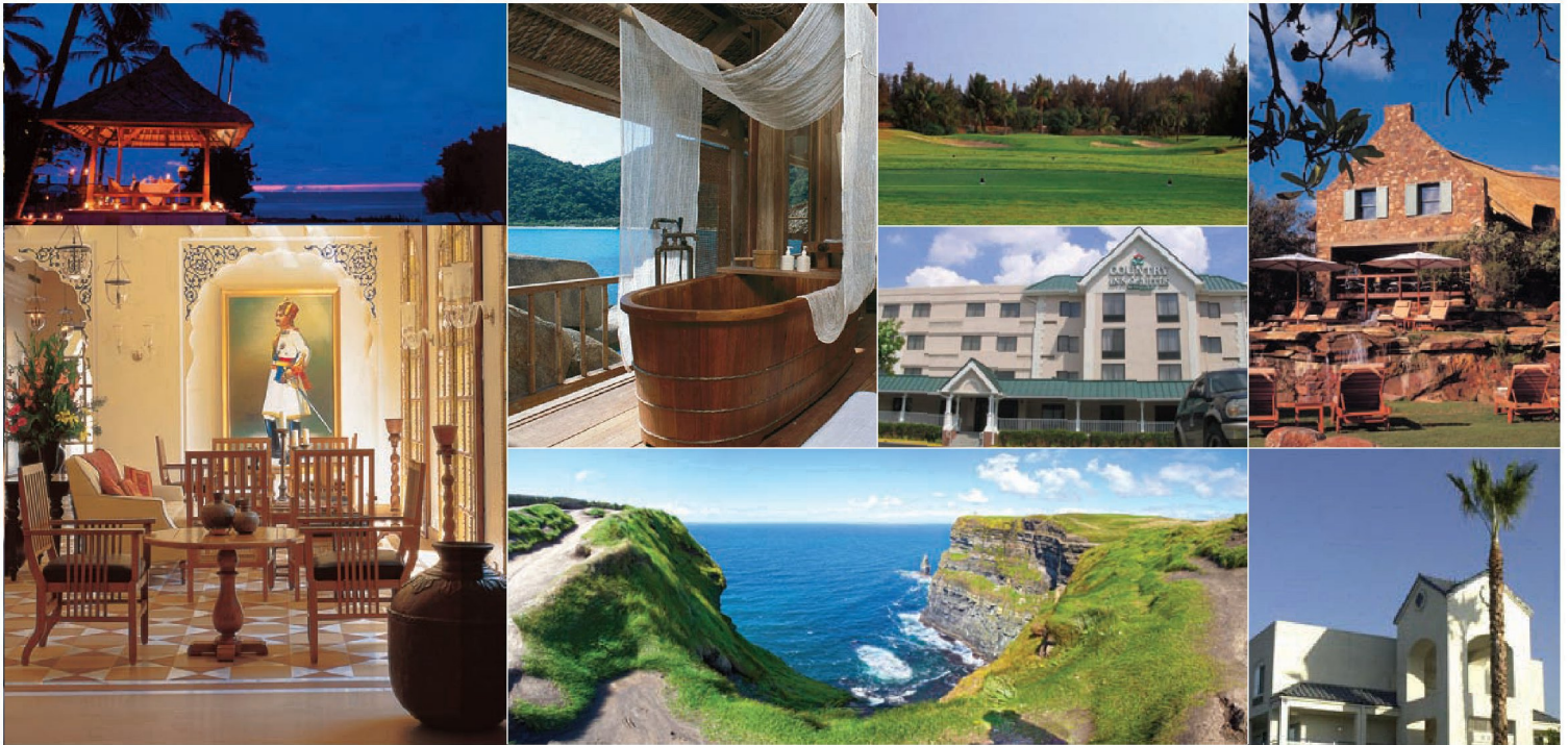
Exhibit VIII.C.18.a. (cont.)