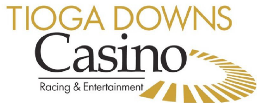
Exhibit VIII.A.6.b. – Financing Descriptive

Submit as Exhibit VIII.A.6.b. a detailed description of how the project will be financed. Provide a statement of financing sources and uses for the Application fee, Application and suitability investigation expenses, license fee, capital investment deposit, and construction of the proposed Gaming Facility based on the proposed construction budget and timeline provided pursuant to Items VIII.C.19. and VIII.C.20. of this RFA, including reasonable and customary contingencies, and the pro-forma forecasted financial information provided pursuant to Item VIII.A.4. of this RFA. Provide a statement of financing sources and uses, annually, for at least the first three (3) years after beginning gaming operations using each of the high-, average- and low-case scenarios included in the pro-forma forecasted financial information provided pursuant to Item VIII.A.4. of this RFA. Expressly identify the funding source to cover any forecasted operating losses.